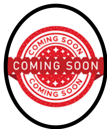
Senior Research Analyst

Graduate Assistant, focuses on special projects and IRA communication